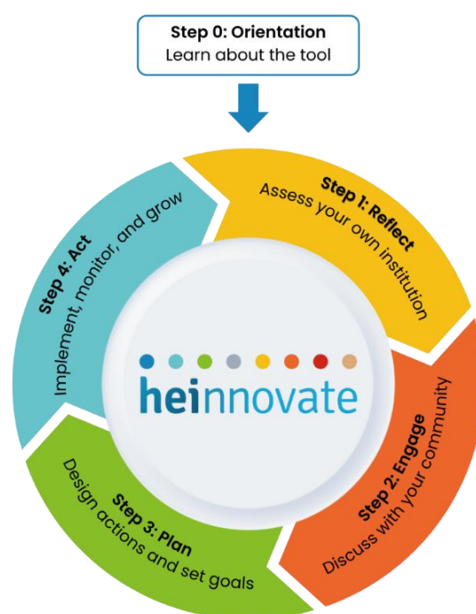
FIGURE 1. THE HEINNOVATE JOURNEY

! This Guide supports alliances of higher education institutions engaging with HEInnovate. It is primarily addressed to European Universities Alliance coordinators, institutional leaders, HEInnovate coordinators, and Alliance working groups involved in innovation,