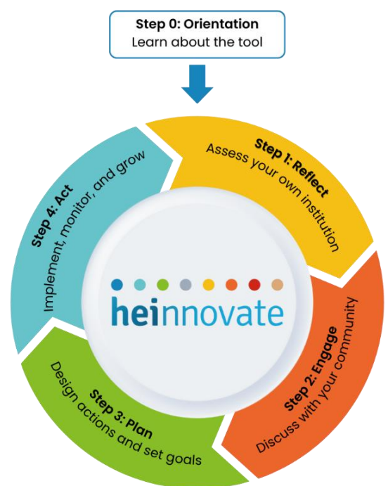
FIGURE 1. THE HEINNOVATE JOURNEY

! This Guide supports alliances of higher education institutions engaging with HEInnovate. It is primarily addressed to European Universities Alliance coordinators, institutional leaders, HEInnovate coordinators, and Alliance working groups involved in innovation,